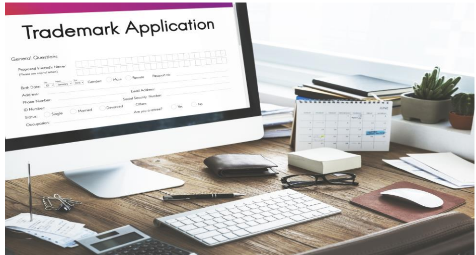
Picture: Trademark registration